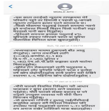
Figure 5: Showing the screenshot message send by MOALD-AITC

Ministry of Agriculture and Livestock Development (MOALD) - Agriculture Information and Training Center (AITC) send the mobile messages related to farming practices, what to do in certain period, weather alert message (AITC, 2023). They send messages to the technician and progressive farmers so they can disseminate the information and farmers can manage their cropping schedule. They send messages in every week (AITC, 2023).