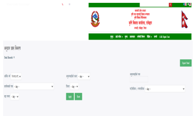
Figure 7: Showing screenshot of official page of ADO, Ramechhap

Agriculture Development Office (ADO) Ramechhap develops the online access portal to increase the transparency of organization (ADO Ramechhap, 2023). In this platform anyone can visit and see the information of farmers/groups/co-operative who received the different subsidy program from ADO Ramechhap in different fiscal years.