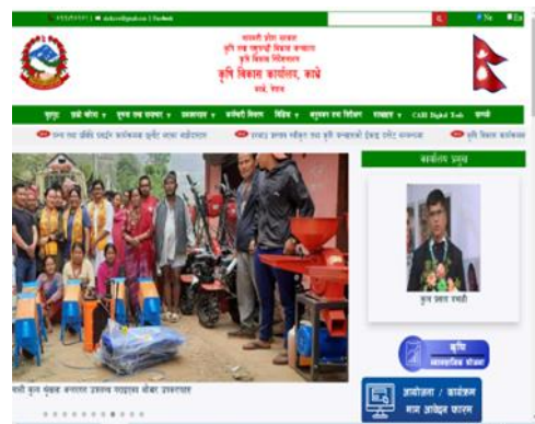
Figure 6: Showing screenshot of official page of ADO, Kavre

Agriculture Development Office (ADO), Kavre develops the software for online application form; farmers can visit this site by linking the website provided by ADO, Kavre in their official page (ADO kavre, 2023). Where farmers have the option to choose the different programs in this platform and upload the necessary documents as mentioned in notice or in this website. Finally, farmers can submit their application form to ADO office, Kavre.