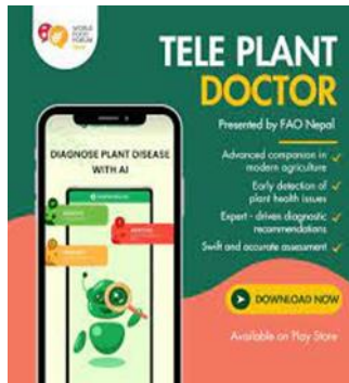
Figure 2: Showing the screenshot view of Tele Plant Doctor

Tele Plant Doctor, a mobile application designed to diagnose plant diseases using artificial intelligence (AI)(Aryal, 2024). This apps is launched in Mahadevsthan, Kavre especially focusing on potato grower (FAO, 2024). It strengthen pesticide management capacities of farmers for their crops (FAO, 2024).