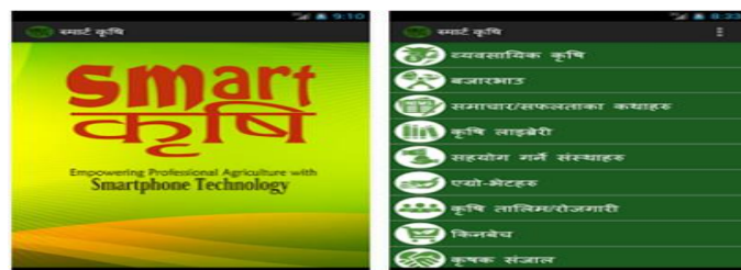
Figure 1: Showing the screenshot view of Smart Krishi

Smart Krishi apps was developed by Anil Regmi in 2015. It produces information necessary for farmers in the form of videos and texts, format of business plans and proposals, government notices and agriculture news (Adhikari, 2023). It provides farming tips, pest and disease management practices, market price, agricultural news, soil health information etc.